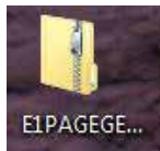
Figure 1: E1PageGenerator Zip File

Once you download it, you will get a zip file similar to what you see in Figure 1.